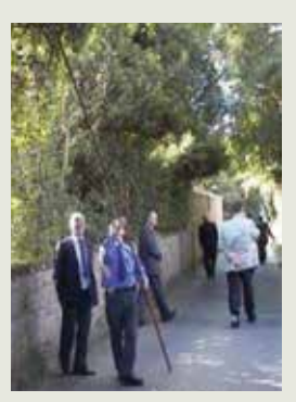
Roads Inspectors carrying out the twice yearly Visite du Branchage

The Law (Loi (1914) sur La Voirie) - literally, 'Law (1914) on the Road', is over one hundred years old. In accordance with the Law, Parish officials tour their parishes to ensure the Law has been observed. These 'Visite du Branchage' inspections take place every year in each parish in the three weeks from 24th June and 1st September. Under Article 41 of the Law, at least a week before the Visites, the Connétables publish a Notice in the Jersey Evening Post to inform their parishioners who occupy houses or who own lands bordering on public roads to cut back the growth along the edge of the public roads and footpaths. This includes all brambles, vegetation and other obstacles encroaching on the public road. A height of at least 12 feet (3.7 metres) must be kept above all public roads and 8 feet (2.4 metres) above footpaths.